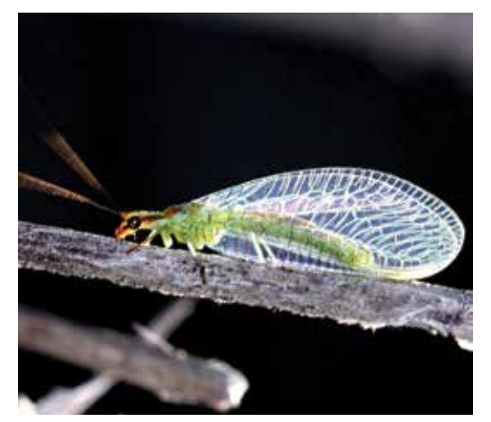
Figure 180. Adult green lacewing. (D.G. James)

Lacewing larvae feed on aphids, thrips, spider mites, and small caterpillars in hop yards. They are frequently found on hop plants and on low-growing vegetation. Green lacewings tend to specialize in feeding on aphids and usually the adults lay their distinctive eggs near aphid colonies. Adult lacewings in the genus Chrysopa are also predatory but adults in other genera require carbohydrate-rich foods such as aphid honeydew or flower nectar or pollen. One to five generations occur per year, with the life cycle occupying four to eight weeks. Adults live for up to three months, producing 100 to 500 eggs.