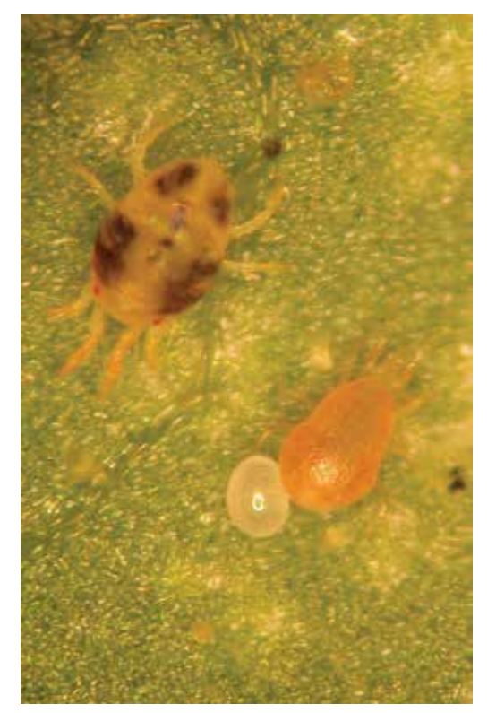
Figure 132. Adult predatory mite, Galendromus occidentalis, lower right, with its opaque, oblong egg. Above left is a twospotted spider mite adult. Most predatory mites range in size from 1/50 to 1/25 inch in length. (D.G. James)

Predatory mites move faster than pest mites. They range in size from 1/50 to 1/25 inch in length and have needle-like mouthparts, which they use to puncture spider mites and suck out body contents. Predatory mites feeding on spider mites change color, temporarily reflecting their meal. Eggs of phytoseiid mites are oblong and slightly larger than the spherical eggs of spider mites (Figs. 132 and 135). Nymphs are smaller and lighter in color, but otherwise are miniature versions of the adult. Anystid mites are velvety red and up to 1/10 inch long (Fig. 136).