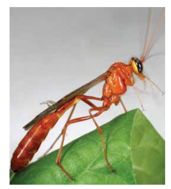
Figures 164, 165, and 166. Various ichneumonid wasps. Adults are up to 1 inch in length. (D.G. James)

Use insecticides and miticides safe to wasps.