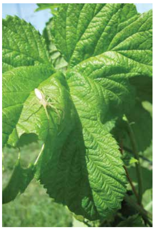
Figure 185. A crab spider on a hop plant.