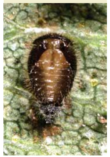
Figure 151. Pupa of the miteeating lady beetle S. picipes has pointed posterior end and vellow hairs covering the body. (D.G. James)

Use only insecticides and miticides safe to mite-eating lady beetles.