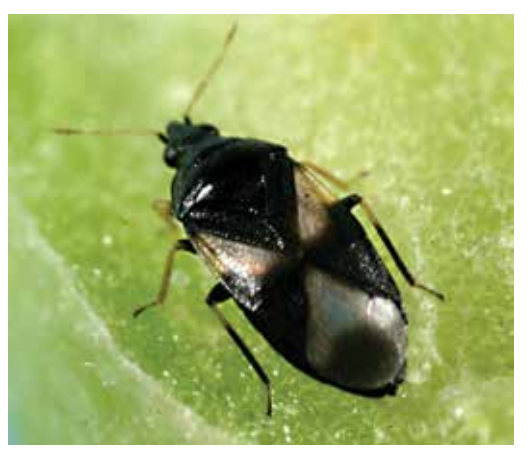
Figure 152. Adult minute pirate bug. (D.G. James)

Adult minute pirate bugs are 1/12 to 1/5 inch long, oval, and black or purplish with white markings on the forewings (Fig. 152). The wings extend beyond the tip of the body. The tiny (1/100 inch) eggs are embedded in plant tissue with the "lid" exposed, through which the nymph emerges (Fig. 153). Newly hatched nymphs are transparent with a slight yellow tinge, turning yellow-orange to brown with maturity (Fig. 154). They are fast moving, wingless, and teardrop-shaped.