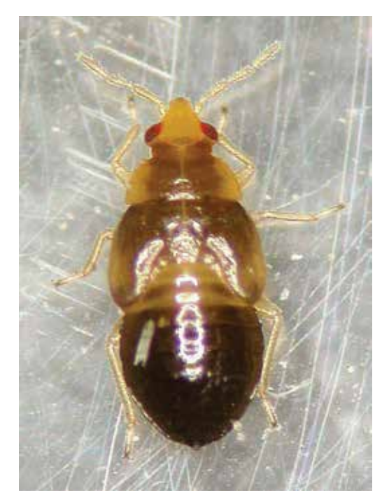
Figure 154. Minute pirate bug nymphs are wingless and teardrop-shaped. Older ones are yellow-orange to brown in color.

Minute pirate bugs overwinter as adults in leaf litter or under bark and usually emerge from hibernation in late March or early April. They feed on mites, aphids, thrips, hop loopers, and other soft-bodied insects. Eggs take three to five days to hatch, and development from egg to adult through five nymphal stages takes a minimum of 20 days. Females lay an average of approximately 130 eggs over a 35-day period, and several generations are produced during spring and summer. When prey is not available, minute pirate bugs are able to survive feeding on pollen and plant juices. Adults and immatures can consume 30 to 40 spider mites or aphids per day. Minute pirate bugs are efficient at locating prey and are voracious feeders. They aggregate in areas of high prey density and increase their numbers more rapidly when there is an abundance of prey. Minute pirate bugs are common predators in low-input hop yards and may contribute to control of late-season pests, particularly spider mites and hop loopers.