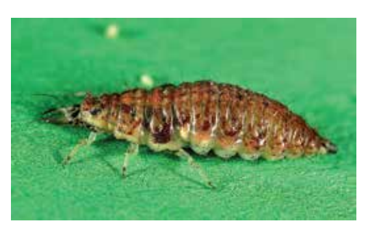
Figure 182. Larva of the green lacewing. Notice the prominent jaws that project forward. (D.G. James)