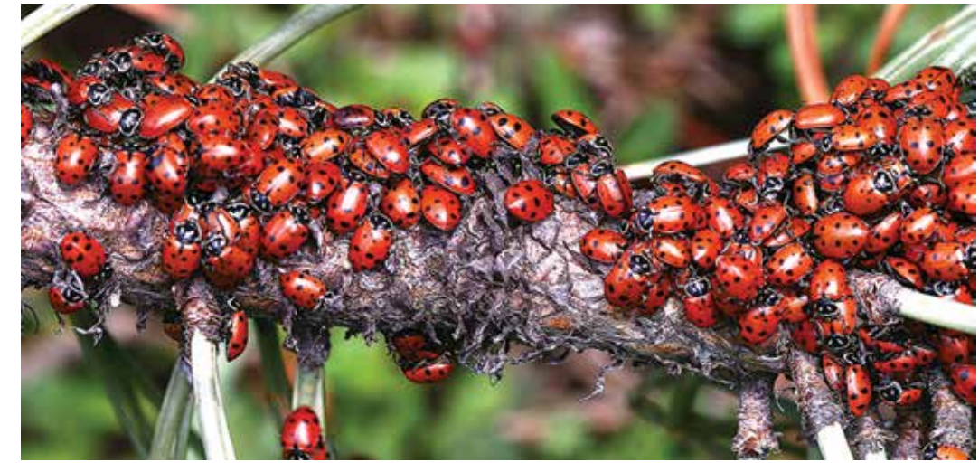
Figure 140. Convergent lady beetle adults congregating during aestivation. (D.G. James)