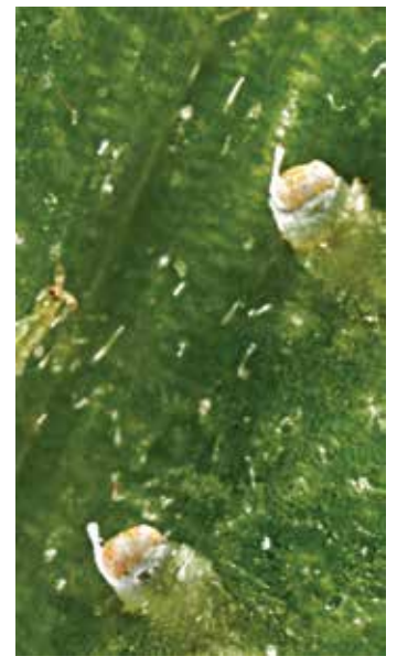
Figure 157. Elongate predatory mirid eggs are inserted into plant tissue. (D.G. James)