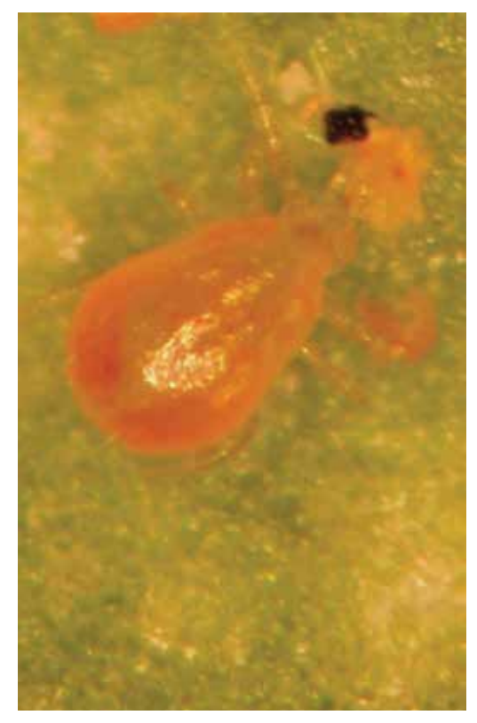
Figure 133. Adult predatory mite, Neoseiulus fallacis . Notice shiny appearance and distinctive pear shape. (D.G. James)

Figure 132. Adult predatory mite, Galendromus occidentalis, lower right, with its opaque, oblong egg. Above left is a twospotted spider mite adult. Most predatory mites range in size from 1/50 to 1/25 inch in length. (D.G. James)