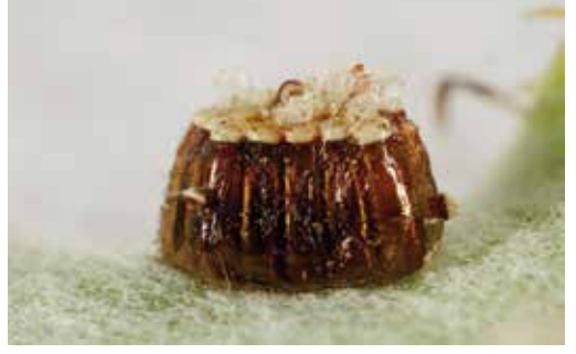
Figure 161. Raft of eggs laid by an assassin bug. (D.G. James)