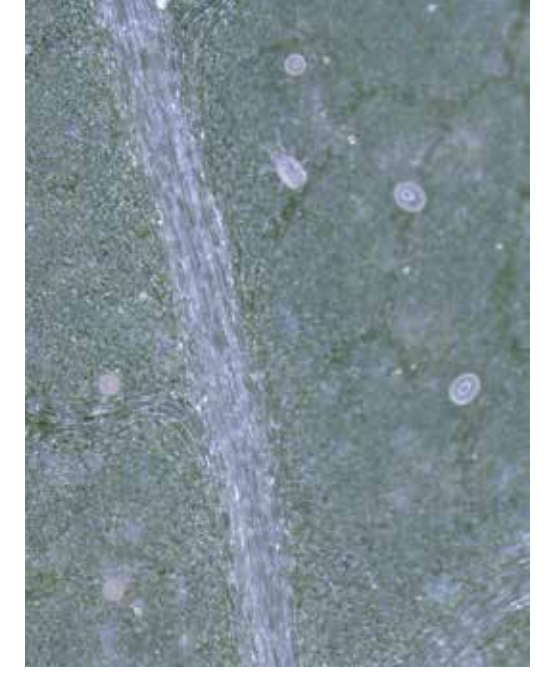
Figure 135. Galendromus occidentalis immature and two (oval) eggs. The round eggs at the top and left are pest mite eggs. (T. Brooks)

Predatory mites are extremely sensitive to broad-spectrum pesticides and sulfur fungicides. However, many new-generation insecticides, miticides, and fungicides are non-toxic to predatory mites and should be used in preference to those that are not. Predatory mites also can be conserved by providing in-yard and adjacent refugia that harbor overwintering populations.