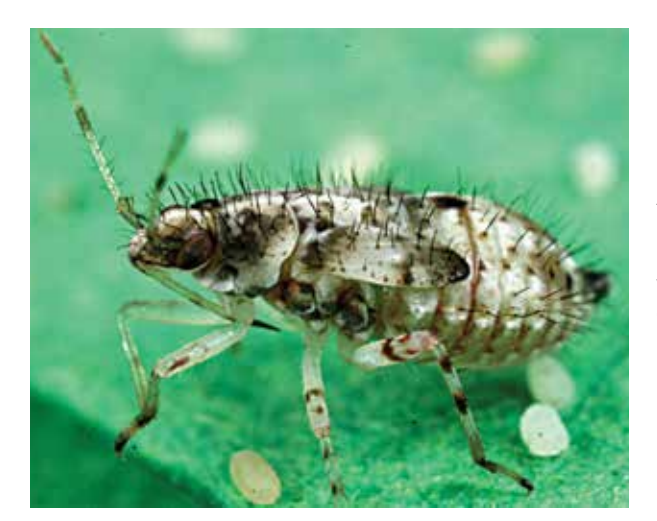
AT LEFT: Figure 158. Predatory mirid nymphs are mottled pale gray with long gray hairs on the thorax and abdomen. (D.G. James)