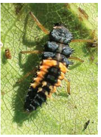
Figure 142. Fourth-instar H. axyridis larva. (D.G. James)