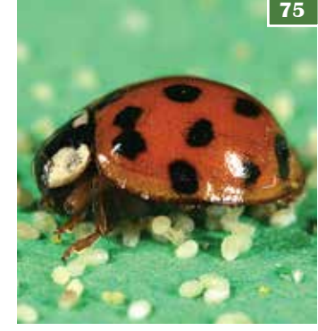
Figure 141. Adult H. axyridis vary in color.

Unmated females overwinter in large congregations, often in buildings or caves (Fig. 143). Mating occurs in spring, and eggs hatch in five to seven days. In summer, the larval stage is completed in 12 to 14 days, and the pupal stage requires an additional five to six days (Fig. 144). In cool conditions development may take up to 36 days. Adults may live for two to three years. H. axyridis is a voracious predator, feeding on scale insects, insect eggs, small caterpillars, and spider mites, as well as aphids. Adults consume 100 to 300 aphids a day, and up to 1,200 aphids may be consumed during larval development.