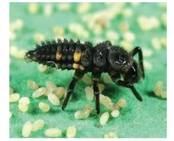
Figure 139. Alligator-shaped convergent lady beetle larva has orange spots.