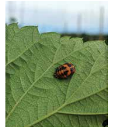
Figure 144. This lady beetle pupa is likely that of H. axyridis.