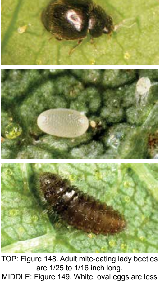
than 1/50 inch long. BOTTOM: Figure 150. Newly hatched S. picipes larva.

Mite-eating lady beetles are critical to good biological control of spider mites. One or two Stethorus beetles are usually sufficient to control an early-season mite "hot spot," preventing it from spreading into a larger outbreak. In combination with predatory mites, Stethorus may maintain non-damaging levels of spider mites during July and August. Monitoring can be conducted by examining leaves in the field or a laboratory by looking for tiny alligator-like larvae or mobile, pinhead-sized black dots. The beetles also can be shaken from bines and collected onto a tray. Stethorus spp. are susceptible to broad-spectrum insecticides and miticides such as abamectin. However, many narrow-spectrum pesticides are compatible with the survival of these important predators.