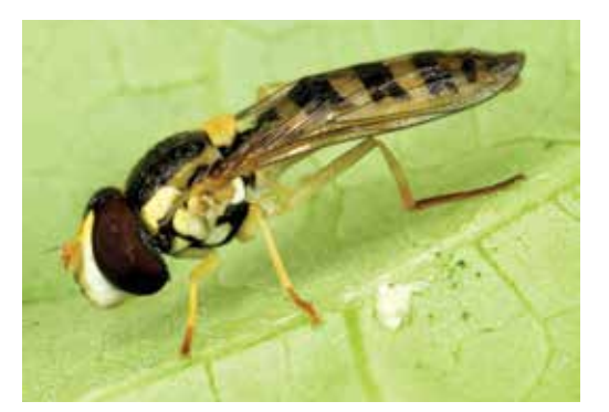
Figure 168. Adult hover fly. (D.G. James)