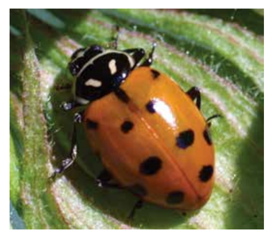
Figure 138. Convergent lady beetle adult.

Adults are strongly oval and convex, approximately 1/4 inch long (Fig. 141). They are highly variable in color and pattern, but most commonly are orange to red with many to no black spots. Some individuals are black with several large, orange spots. The first section between the head and thorax is straw-yellow with up to five black spots or with lateral spots usually joined to form two curved lines, an M-shaped mark, or a solid trapezoid. Eggs are bright yellow and laid in clusters of approximately 20 on the undersides of leaves. Larvae are elongate, somewhat flattened, and adorned with strong round nodules (tubercles) and spines (Fig. 142). The mature larva (fourth instar) is strikingly colored: the overall color is black to dark bluish-gray, with a prominent bright yellow-orange patch on the sides of abdominal segments 1 to 5.