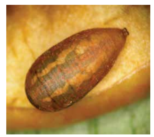
Figure 170. Hover fly pupa.

Adult hover flies may be monitored using yellow sticky traps; the maggot-like larvae can be found amongst aphid colonies. Hover flies are an important component of biologically based hop aphid management. In combination with lady beetles and predatory bugs, they can provide rapid control of aphid infestations. Hover flies are generally sensitive to broad-spectrum pesticides.