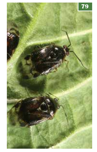
Figure 156. Oval, shiny black adult predatory mirids.

Deraeocoris overwinters as an adult in protected places such as under bark or in leaf litter. Overwintered adults emerge from hibernation during March to April and feed on nectar of willow catkins and other early spring flowers. They seek out prey and begin laying eggs in late April or May. Nymphs of the first generation occur two to three weeks later. Nymphs develop through five stages in approximately 25 days at 70°F. Females lay up to 250 eggs during their lifetime, and adults consume 10 to 20 aphids or mites a day. Nymphs can eat 400 mite eggs a day. Deraeocoris adults and nymphs are important predators that prey on a wide variety of small insects and mites including aphids, thrips, leafhoppers, scale insects, small caterpillars, and spider mites. Two or three generations are produced between May and September. Deraeocoris is abundant in many agricultural and non-agricultural habitats in the Pacific Northwest.