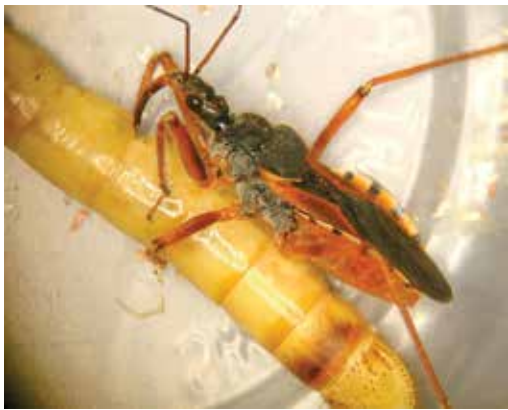
Figures 159 and 160. Adult assassin bug feeding on a beetle larva. (D.G. James)