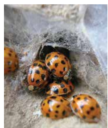
Figure 143. Overwintering H. axyridis. (D.G. James)