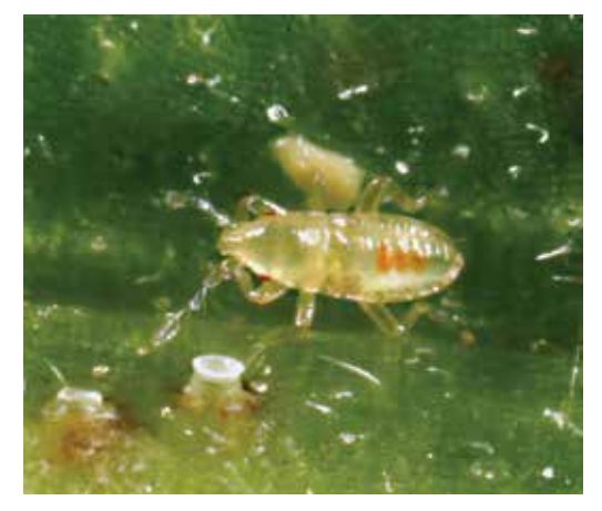
Figure 153. First-instar nymph and egg of the minute pirate bug. Eggs are extremely small (1/100 inch) and embedded within leaves. (D.G. James)