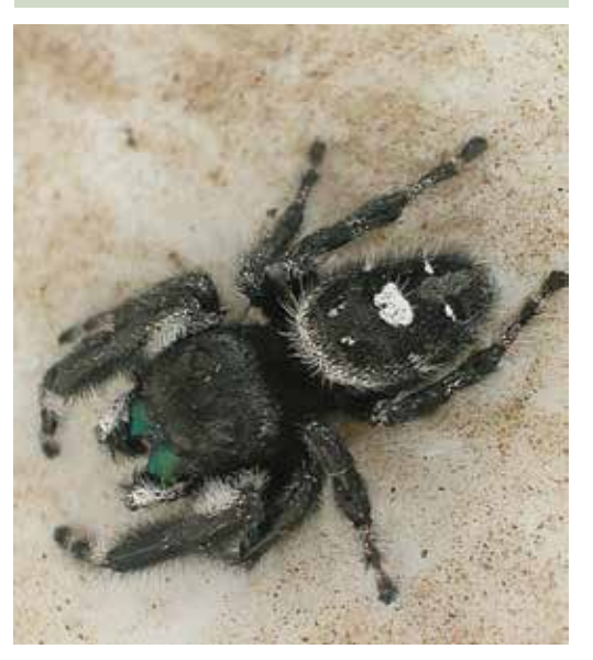
Figure 184. A jumping spider. (D.G. James)

Spiders can be monitored by shaking bines over a tray. The value of spiders to biocontrol is thought to be considerable, but has yet to be evaluated. Most pesticides harm spiders, but populations tend to recover rapidly.