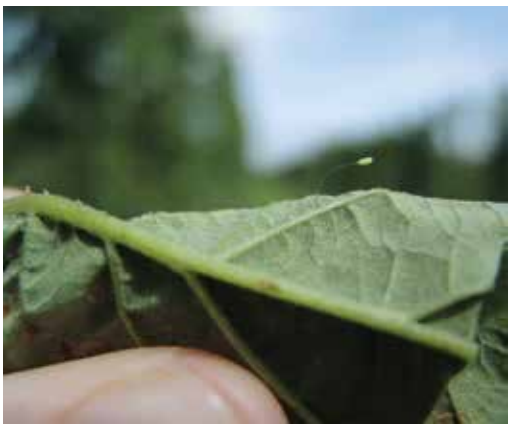
Figure 181. Lacewing egg laid singly on a stalk. (E. Lizotte)