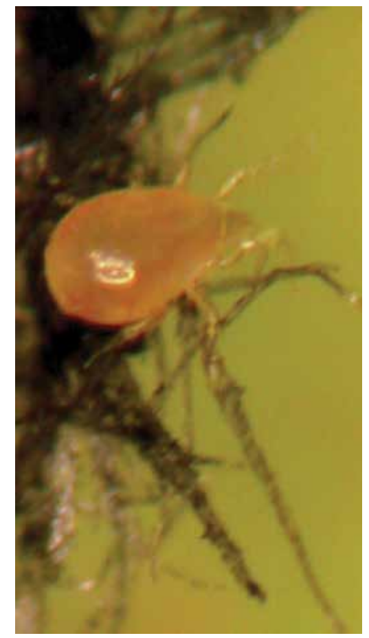
Figure 134. Neoseiulus fallacis are shinier and faster than G. occidentalis and are able to feed on pollen as well as on spider mites. They flourish under cool, moist conditions such as those found in western Oregon. (D.G. James)