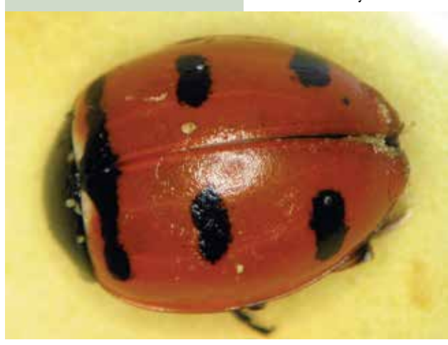
Figure 137. Adult stage of the transverse lady beetle is approximately ¼ inch long and rounded with distinct narrow black markings on the wing covers. (D.G. James)

Transverse lady beetles are native to North America but declining in abundance throughout much of Canada and the eastern U.S. However, they are still relatively common in eastern Washington and are frequently found in hop yards. Overwintered beetles fly into hop yards during April and May and feed on newly established colonies of hop aphids. In some years, C. transversoguttata is very common, but in others it can be scarce; the cause of these population fluctuations is unknown. Transverse lady beetles are also found in other aphid-affected crops such as tree fruit. Adults may consume up to 100 aphids a