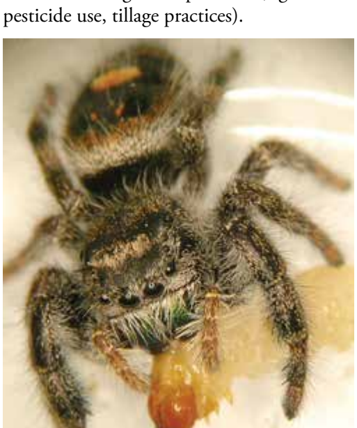
Figure 183. A jumping spider ( Phidippia sp.) feeding on a beetle larva.

Spiders often serve as buffers that limit the initial exponential growth of prey populations. However, the specific role of spiders as effective predators has received little attention and is difficult to demonstrate. There is evidence in many ecosystems that spiders reduce prey populations. They are generalists that accept most arthropods as prey in their webs or in their paths. They eat the eggs and larvae of all the insects and mites that infest hop. Spiders disperse easily to new areas in hop yards and colonize rapidly by aerial ballooning and walking between bines. They are also blown around with wind and debris. The abundance and diversity of spiders in hop yards is linked to the largescale landscape complexity (i.e., hop yard margins, overwintering habitat, weediness) and local management practices (e.g.,