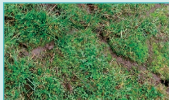
Vole runway damage to turf.