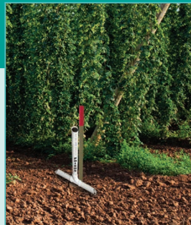
Bait stations are an effective baiting tool on border areas / buffer strips