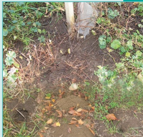
Vole root feeding.